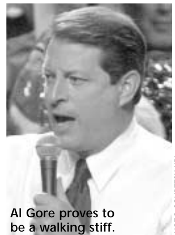
Al Gore proves to be a walking stiff.

"Hi, I'm Al Gore, and I used to be your next president of the United States," is how this looooooser should begin every community development class he plans to teach this fall at UCLA. He should also add, "Because I'm as stiff as a tree and couldn't even win my own state, I was chopped down by the U.S. Supreme Court. I now have plans to live my life in a Redwood forest where I can be among true constituents who appreciate me for who I am: An incompetent politician whose