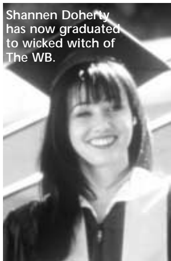
Shannen Doherty has now graduated to wicked witch of The WB.